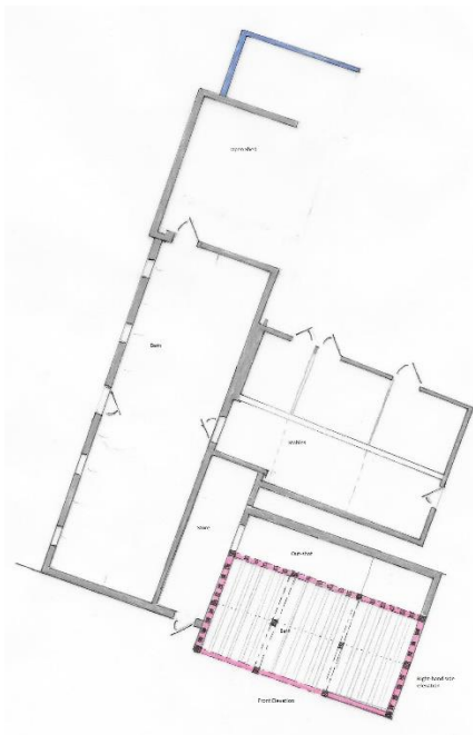
Figure 2 – Plan of part of the farmstead, including barn and associated building

Janice Gooch Heritage Consultancy undertook a site inspection and provided an isometric drawing showing the original timbers, together with an impact assessment of the proposed works.