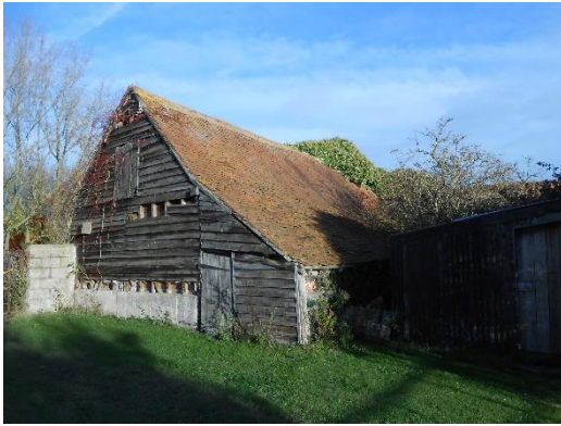
Figure 1- Side elevation of barn

A barn , part of a farmstead on the edge of the beautiful Essex village of Great Totham was looking to be converted into residential use. The local authority had concerns that the structure may be lost, and requested that a record be taken of the original 18 th century barn, and any later additions.