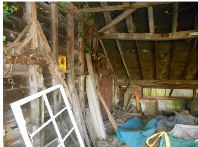
Figure 3 - Interior of barn