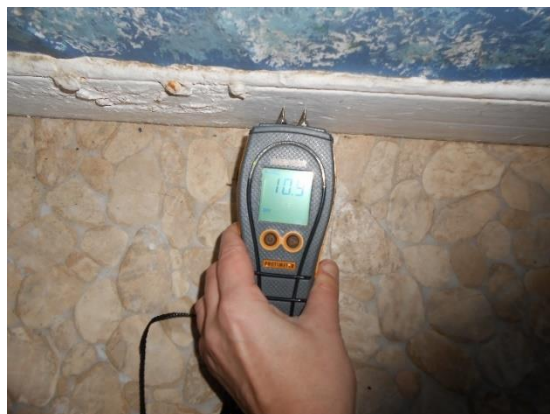
Figure 4 - Damp meter providing indication of defects