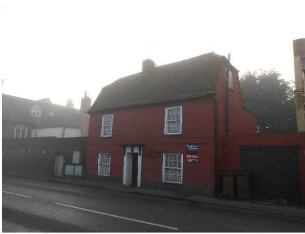
Figure 1 - Exterior of House

This Grade II listed house , situated on the road front had been subject to a recent mortgage survey which raised concerns over damp within the building. The house was constructed in c.1650, and is a combination of a mix of solid wall and timber frame construction.