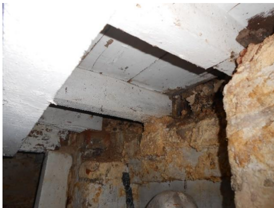
Figure 2 - Cellar of building dated c1650, embedded timber joists within brick wall

provide information on the areas where 'damp' was identified, the causes of the defects and the remedial repair works required.